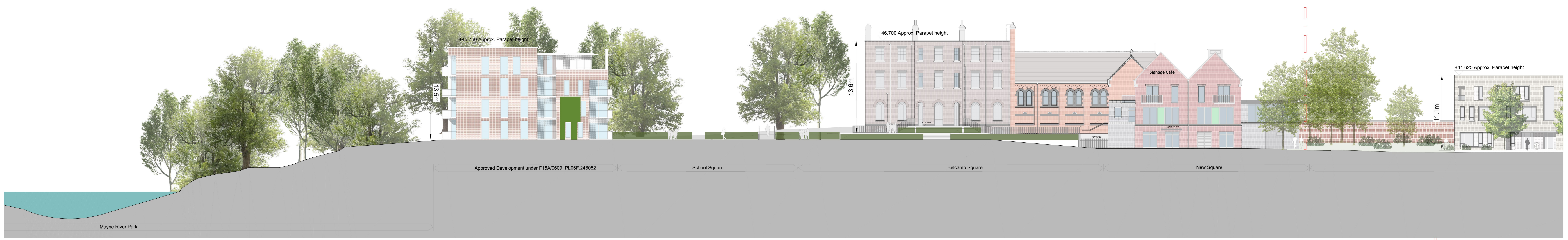
SECTION U-U 2/3