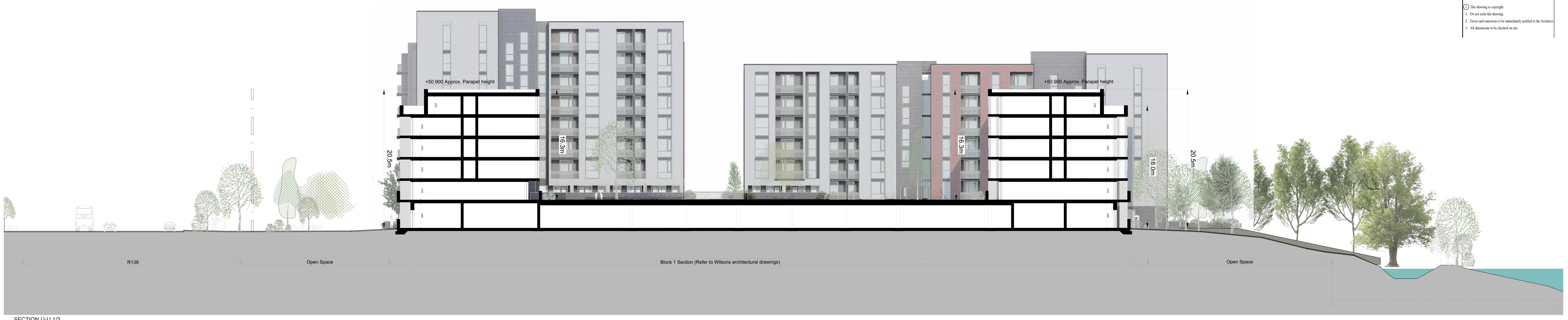
SECTION U-U 1/3

© This drawing is copyright 1. Do not scale this drawing 2. Times and missions to be immediately notified to the Architect 3. All dimensions to be checked on site